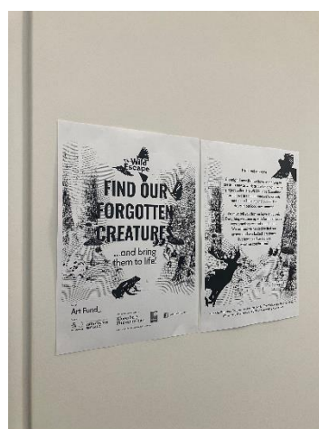
2x A4 poster